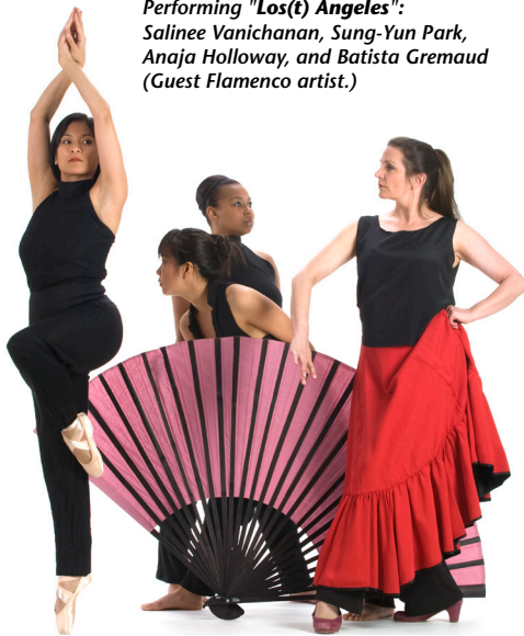
"The Reality Series"