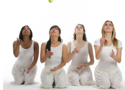
Above: The Tennis Dances.