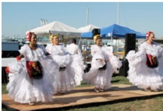
(stage on left, added wooden floor on right. Outdoor Marley covered stage approximately 32 x 28 feet.)